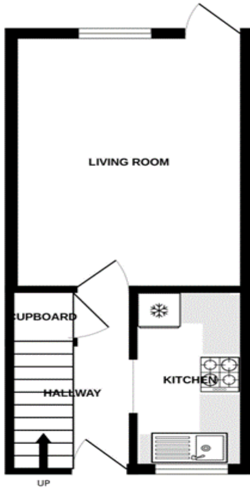
GROUND FLOOR 258 sq.ft. (24.0 sq.m.) approx.