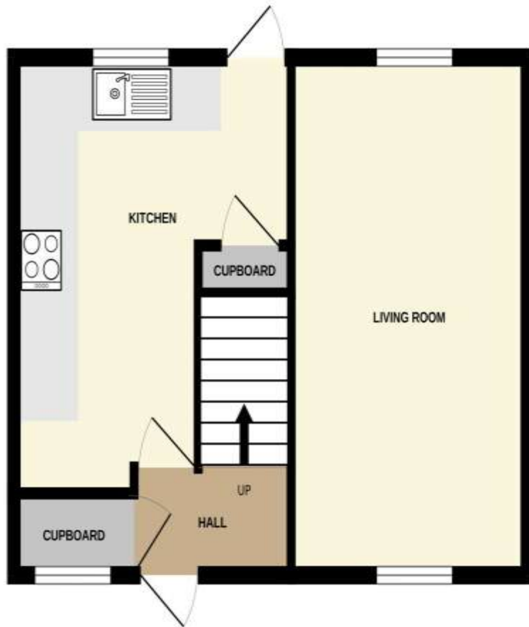
GROUND FLOOR 373 sq.ft. (34.7 sq.m.) approx.